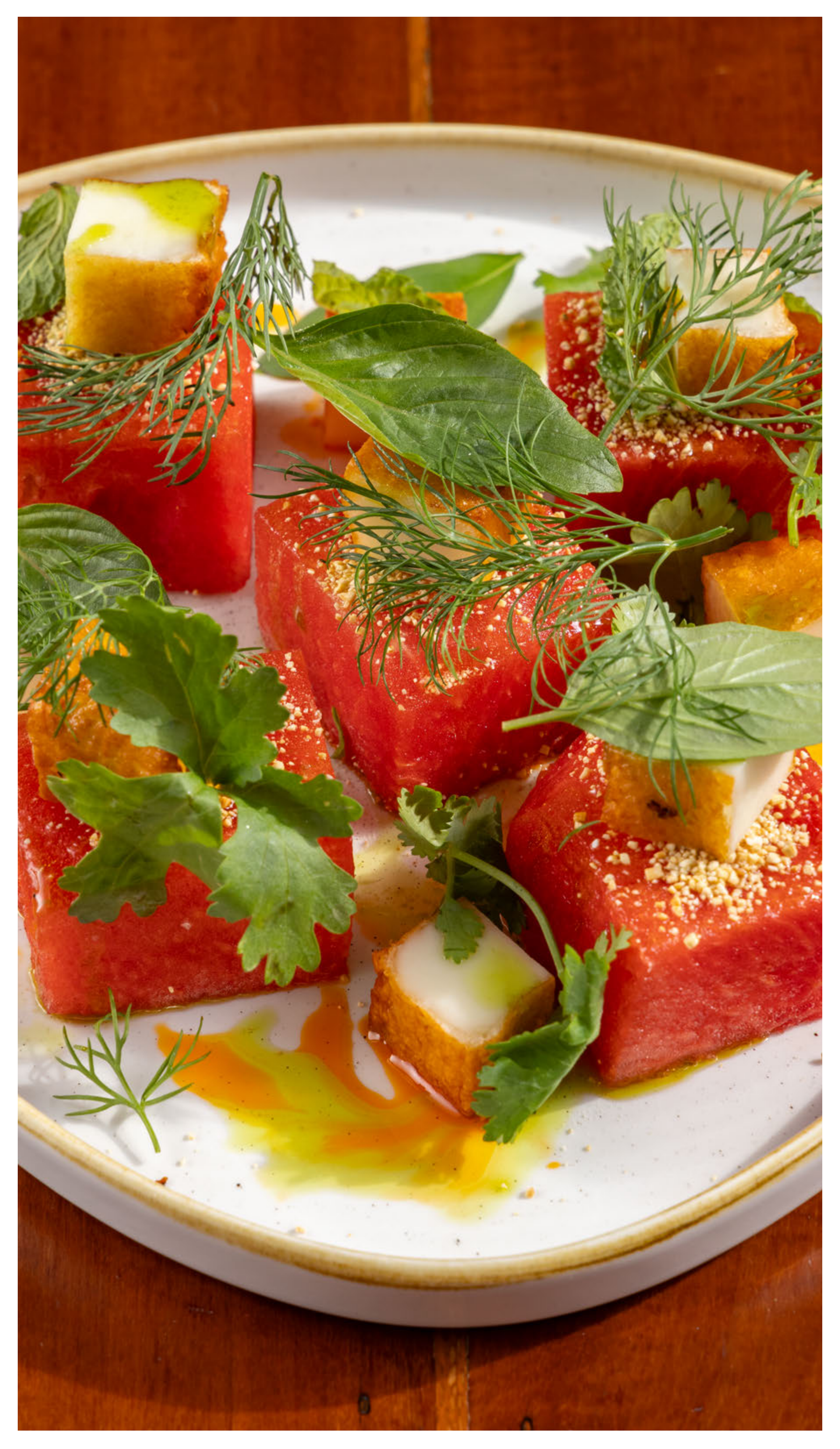
Watermelon & Halloumi Salad FMint, Basil, Coriander, Toasted Rice, Chili + Herb Oil