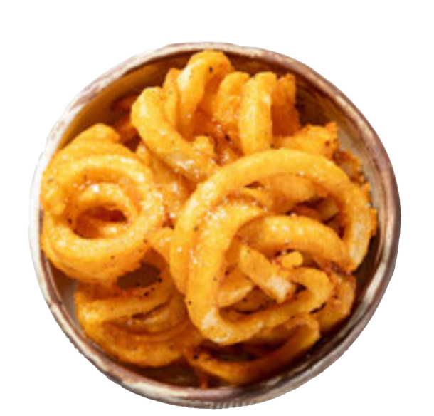
Curly Fries with Truffle Salt