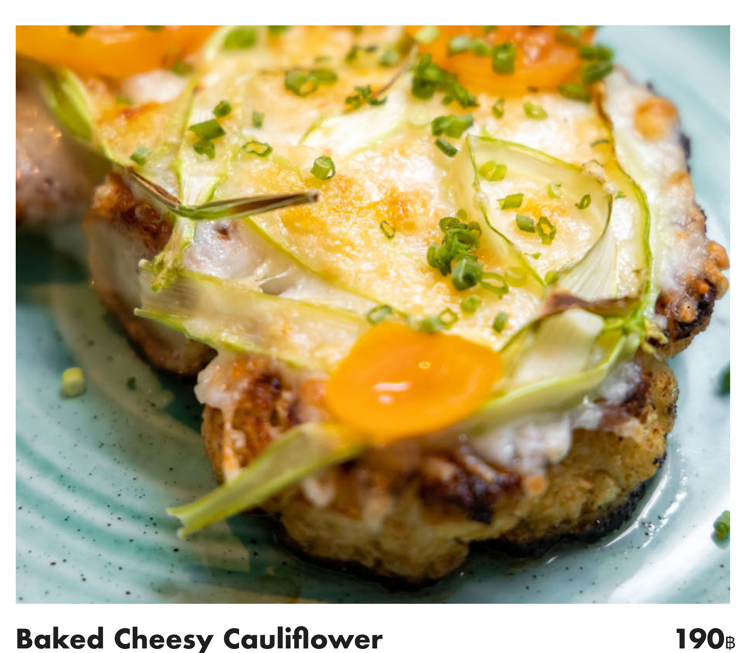
Baked Cheesy Cauliflower

Spicy Seasoned Cauliflower, Mozzarella Cheese, Parmesan Cheese