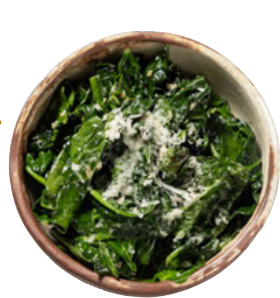
Sautéed Baby Spinach with Garlic & Parmesan Cheese