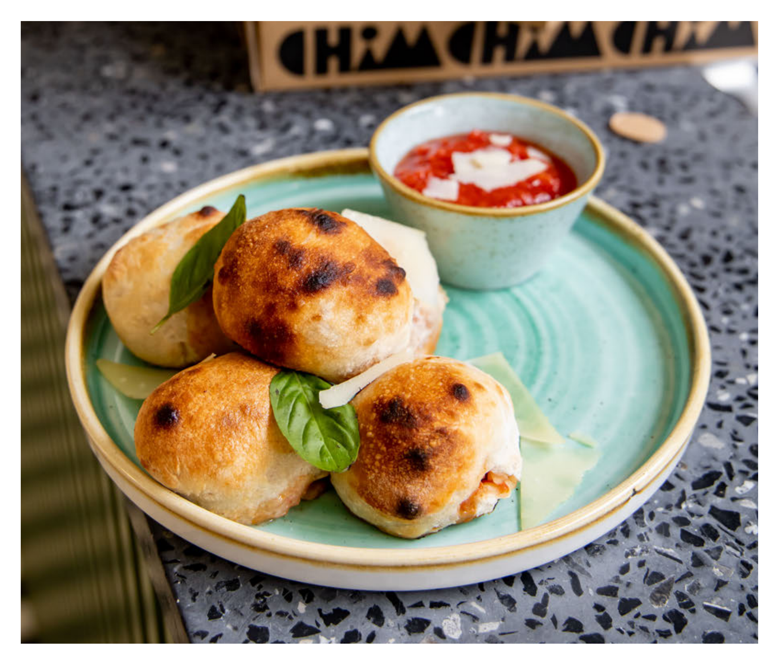
Pizza Bomb Pulled Pork Barbecue