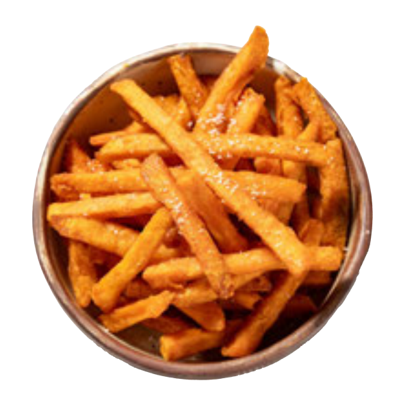
Sweet Potato Fries