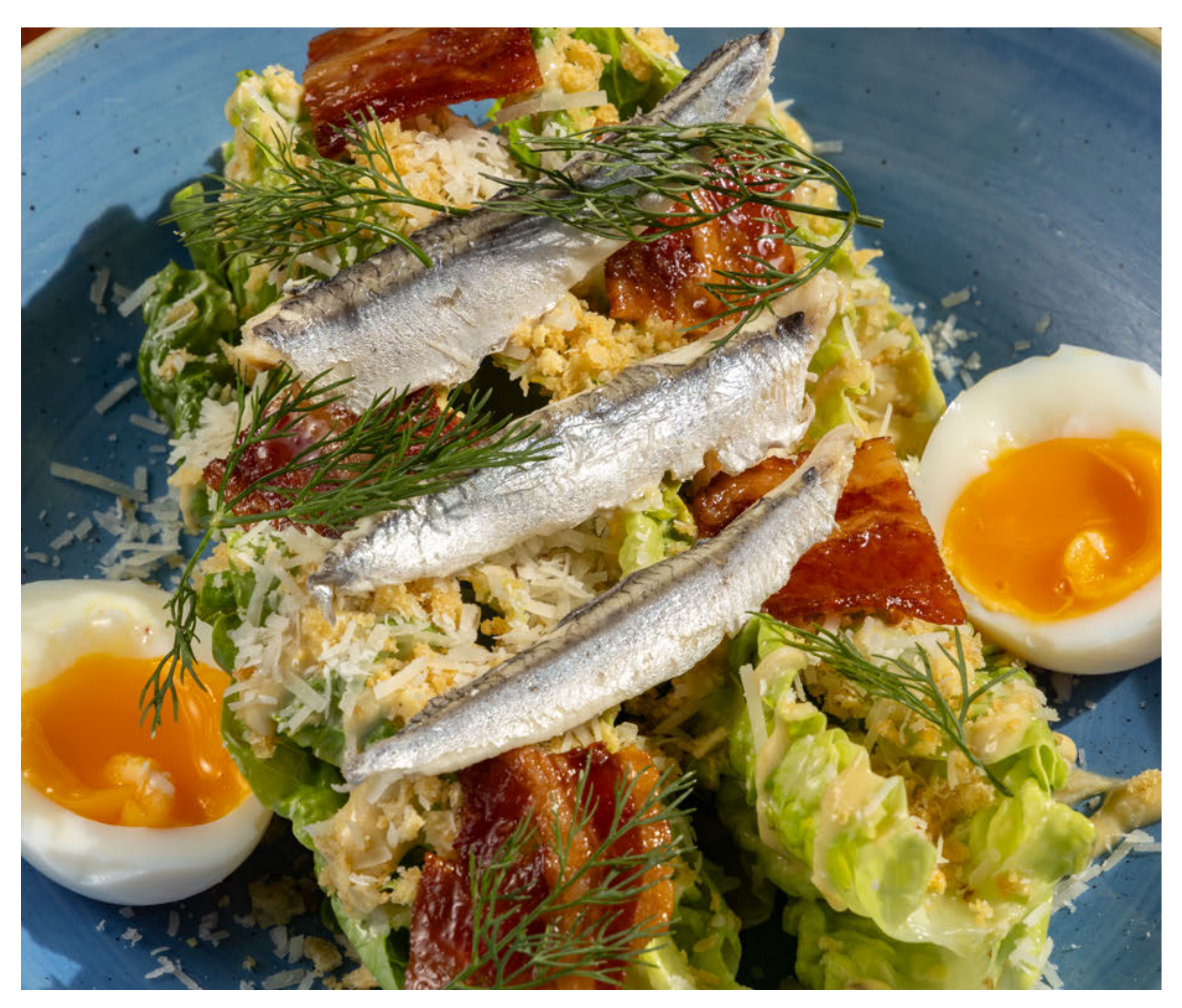
Caesar Salad Baby Romaine, Bacon, Parmesan Cheese, Breadcrumbs, 6min Egg