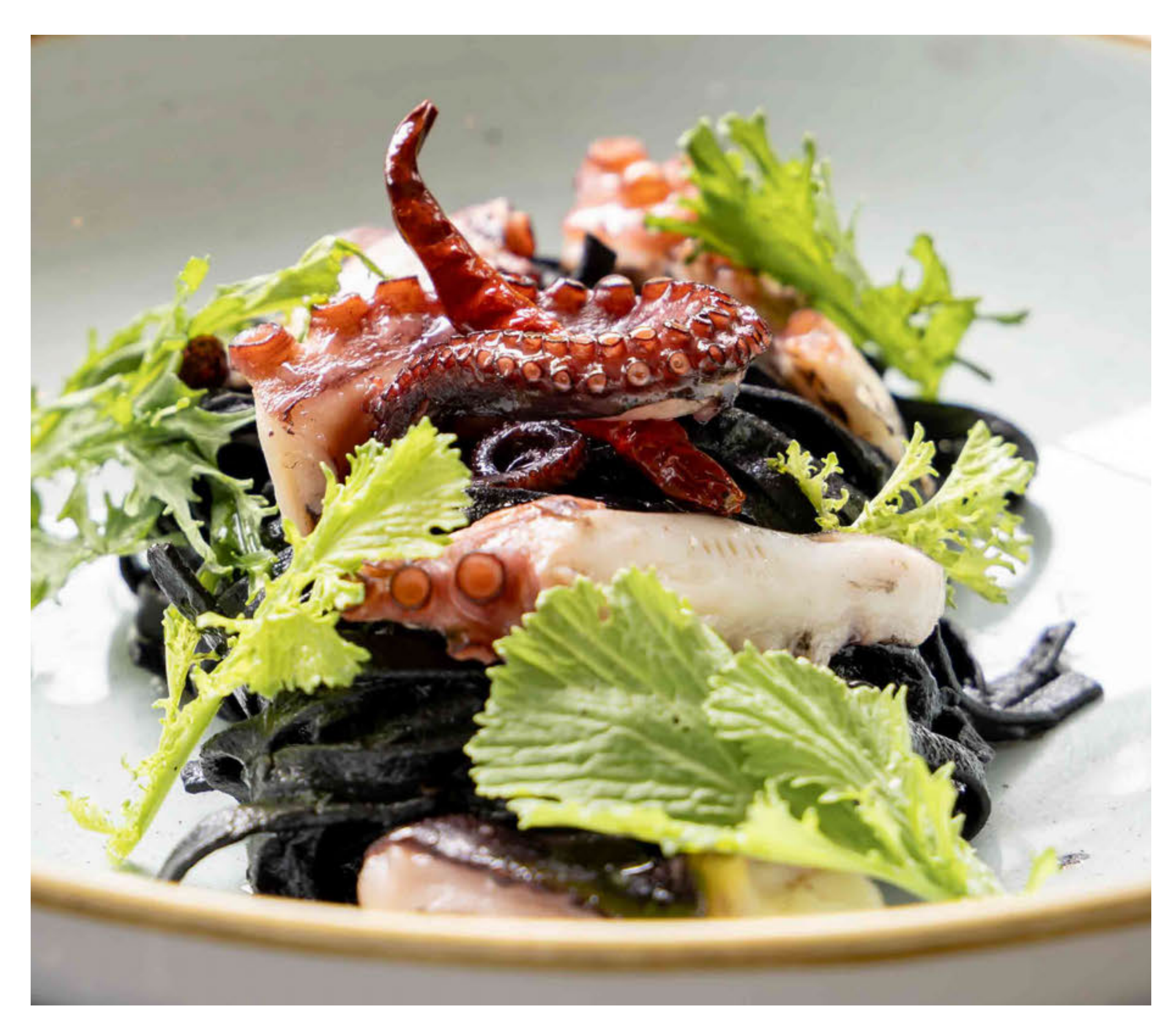
Ink & Octopus Homemade Squid Ink Linguine, Tataki Octopus, Chili Flakes, Tomato, Squid Ink, Dried Chili, Mustard Leaves