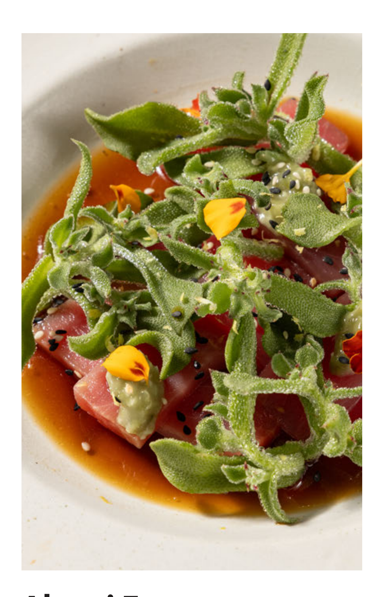
Akami Tuna Poke Akami Tuna, House-made Ponsu, Avocado Wasabi