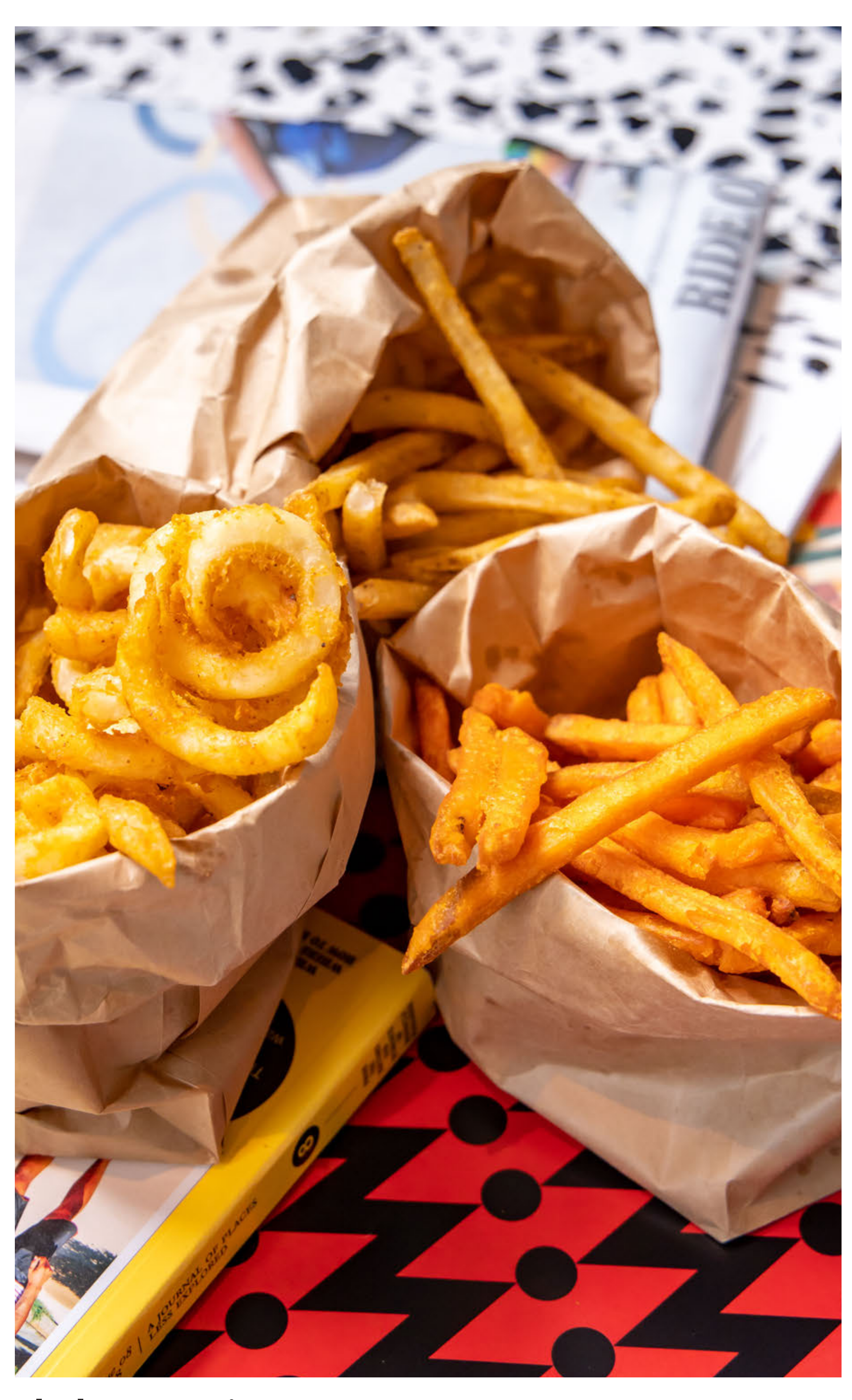
Shake' Em Fries Sweet Potato Fries, Cajun Fries, Curly Fries