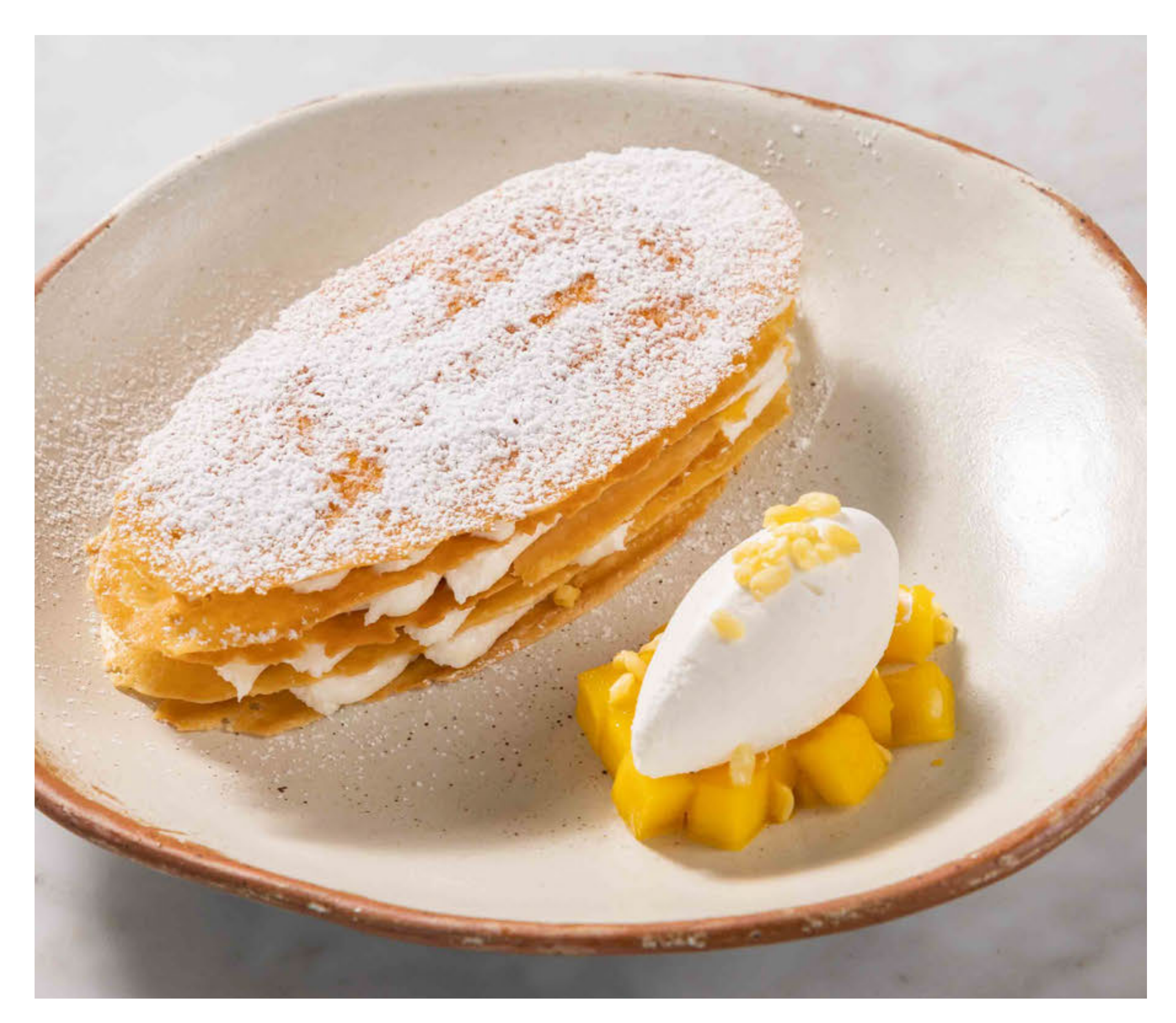
Mango & Sticky Rice Millefeuille Sticky Rice Mousse, Mango Squee, Puff Pastry.