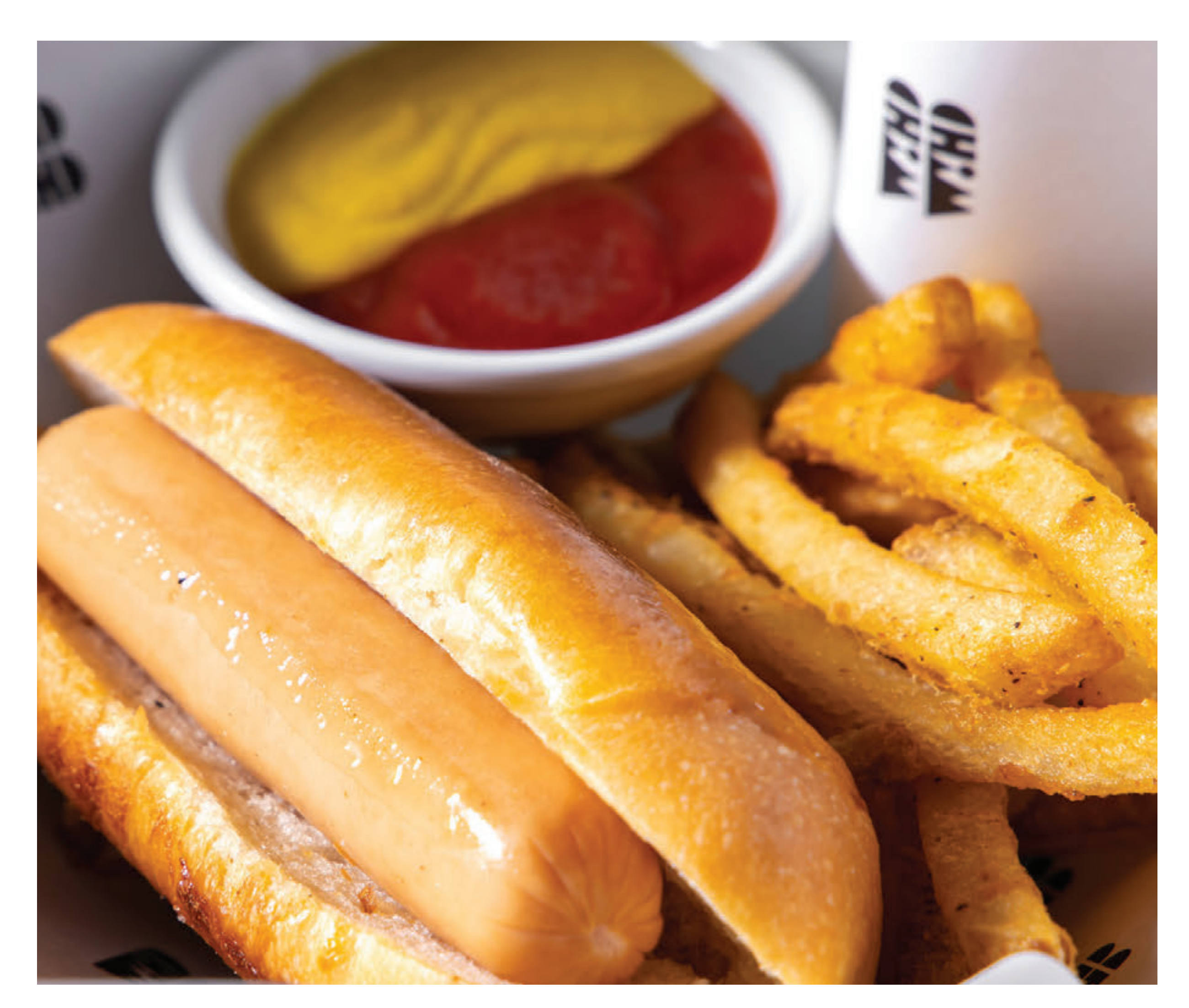
Chicken Hot Dog Hot Dog, Cajun Fries, Mustard & Ketchup