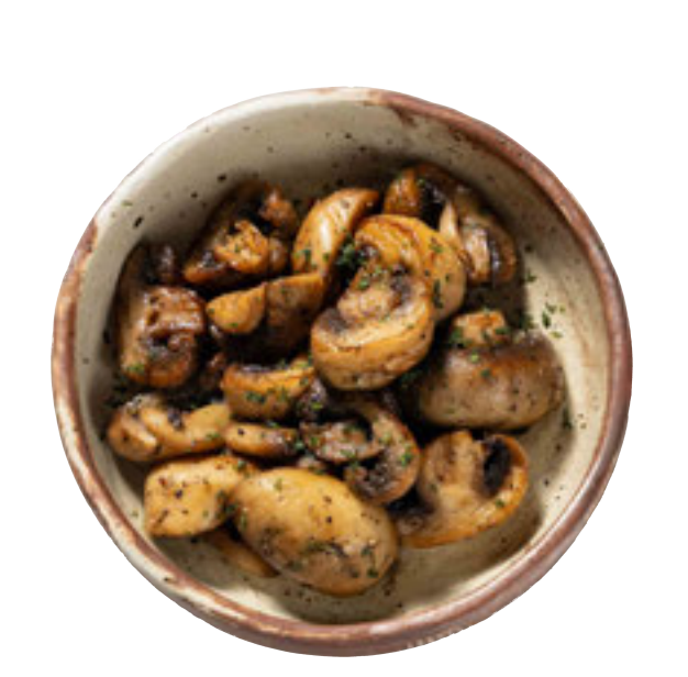
Sautéed Mushroom & Thyme