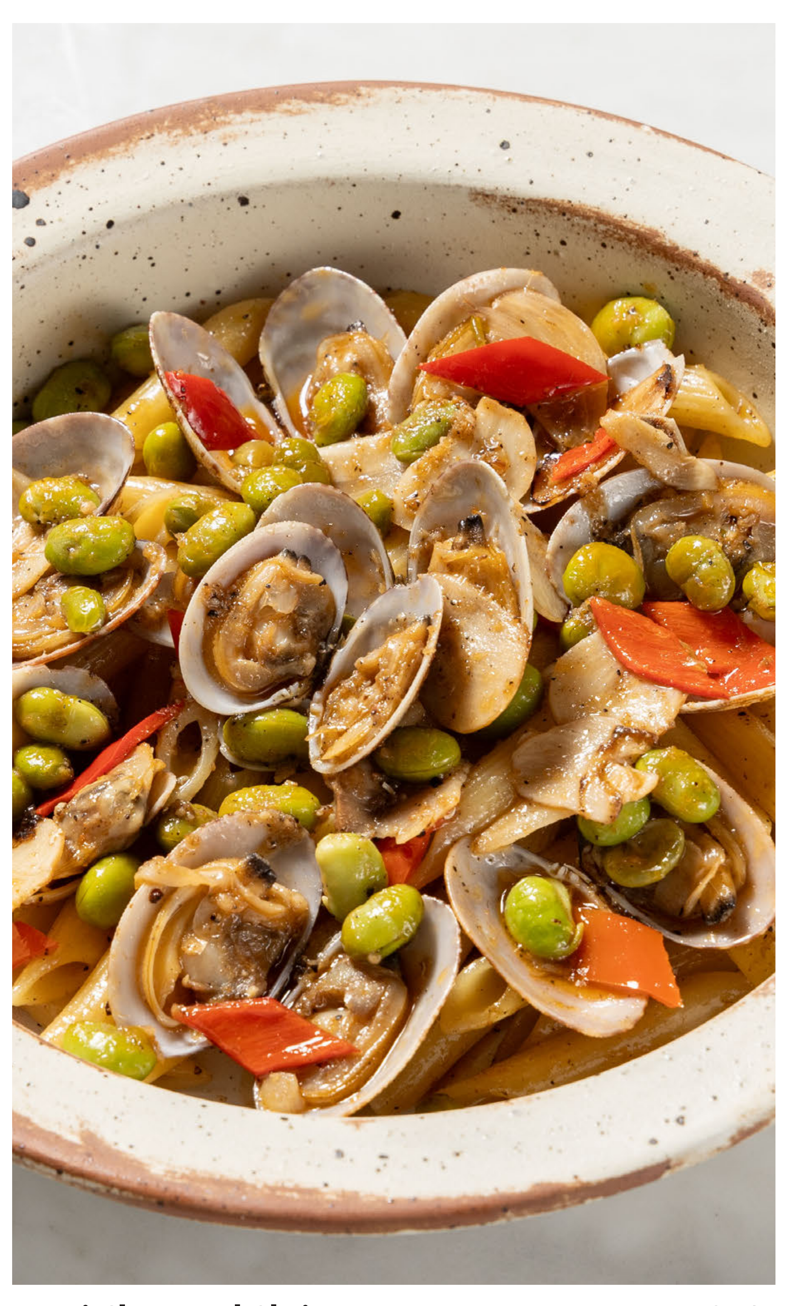
Asari Clam and Shrimp Paste Penne Asari Clam, Shrimp Paste, Edamame, Red Chili, Bottarga