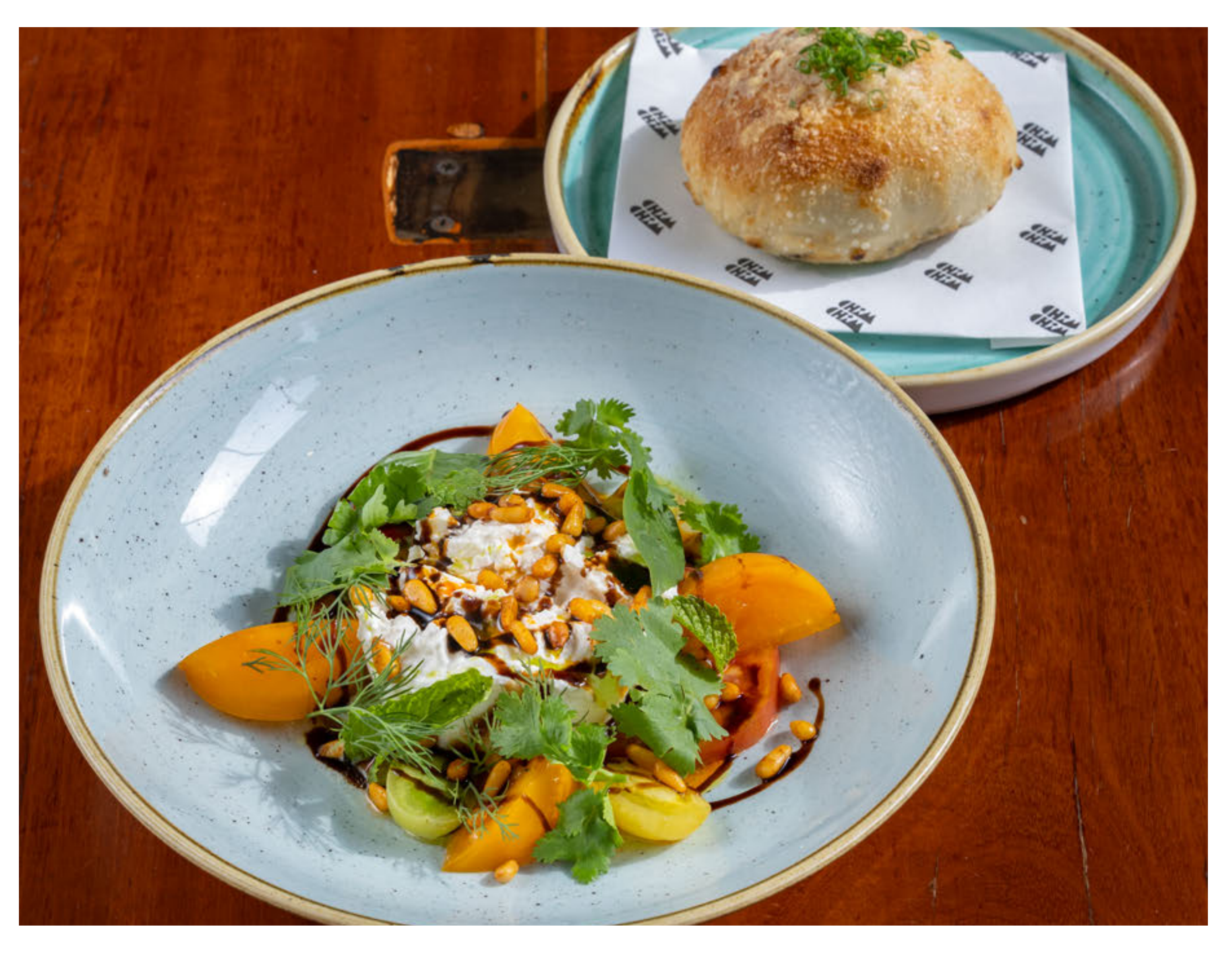
Heirloom Tomato & Burrata Salad

Basil Oil, Balsamic Vinegar, Pine Nuts, Pizza Bread