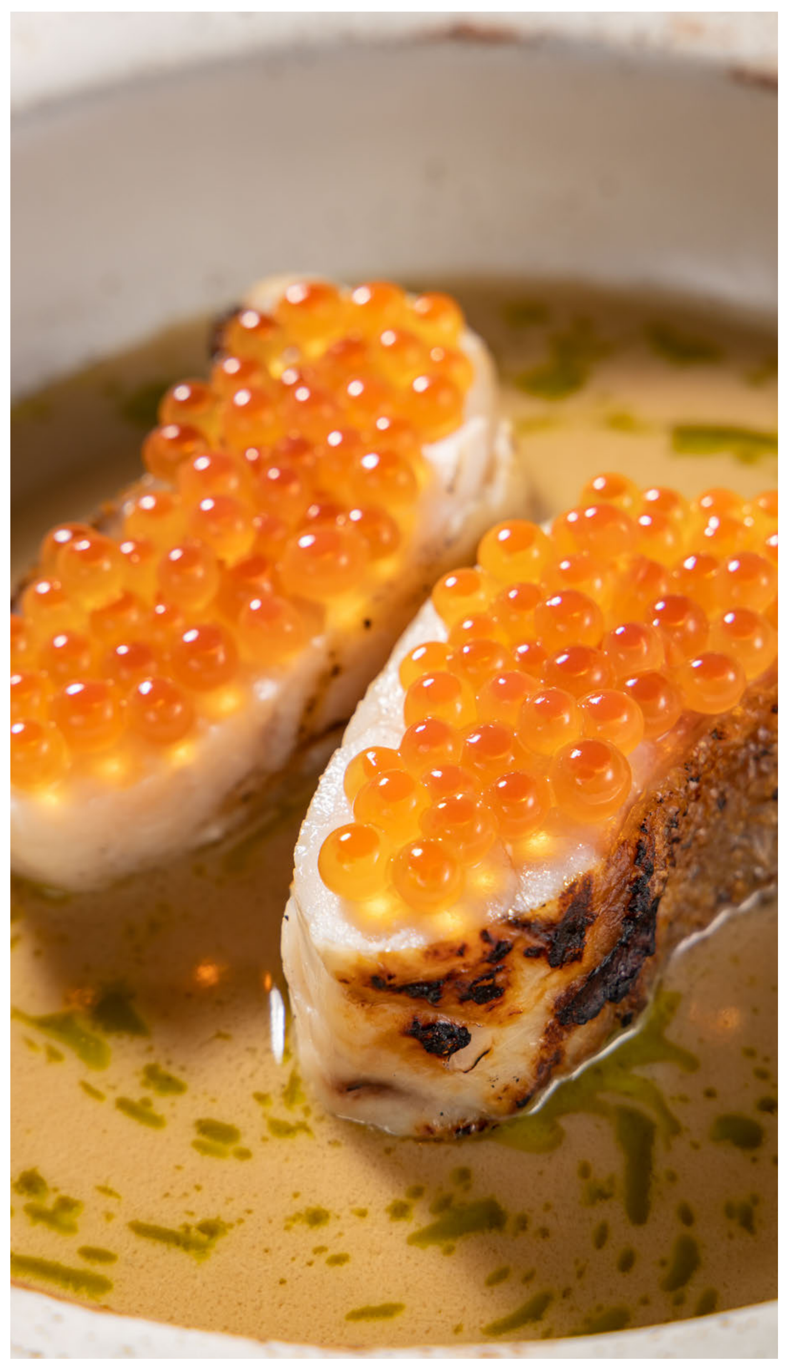
Grilled Coral Grouper Cured Grouper, Coriander & Lime Butter, Ikura