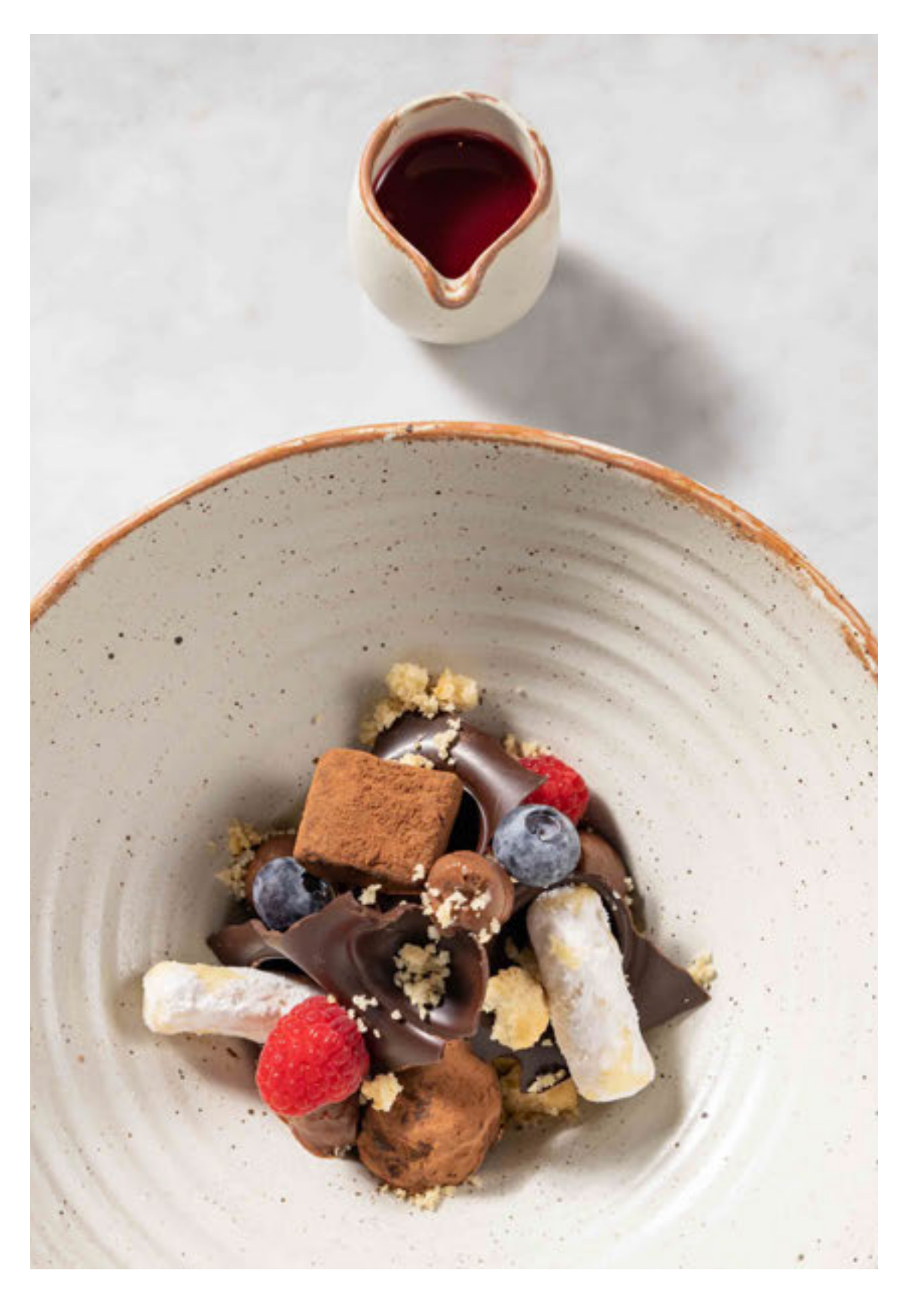
Choco Crack 250® Whisky Coffee Dark Chocolate Truffle, Bailey's Milk Chocolate Nama, White Rum, White Chocolate Truffle, Raspberry Coulis with Vanilla Ice Cream

Sticky Rice Mousse, Mango Sauce, Puff Pastry, Fresh Mango with Coconut Sorbet