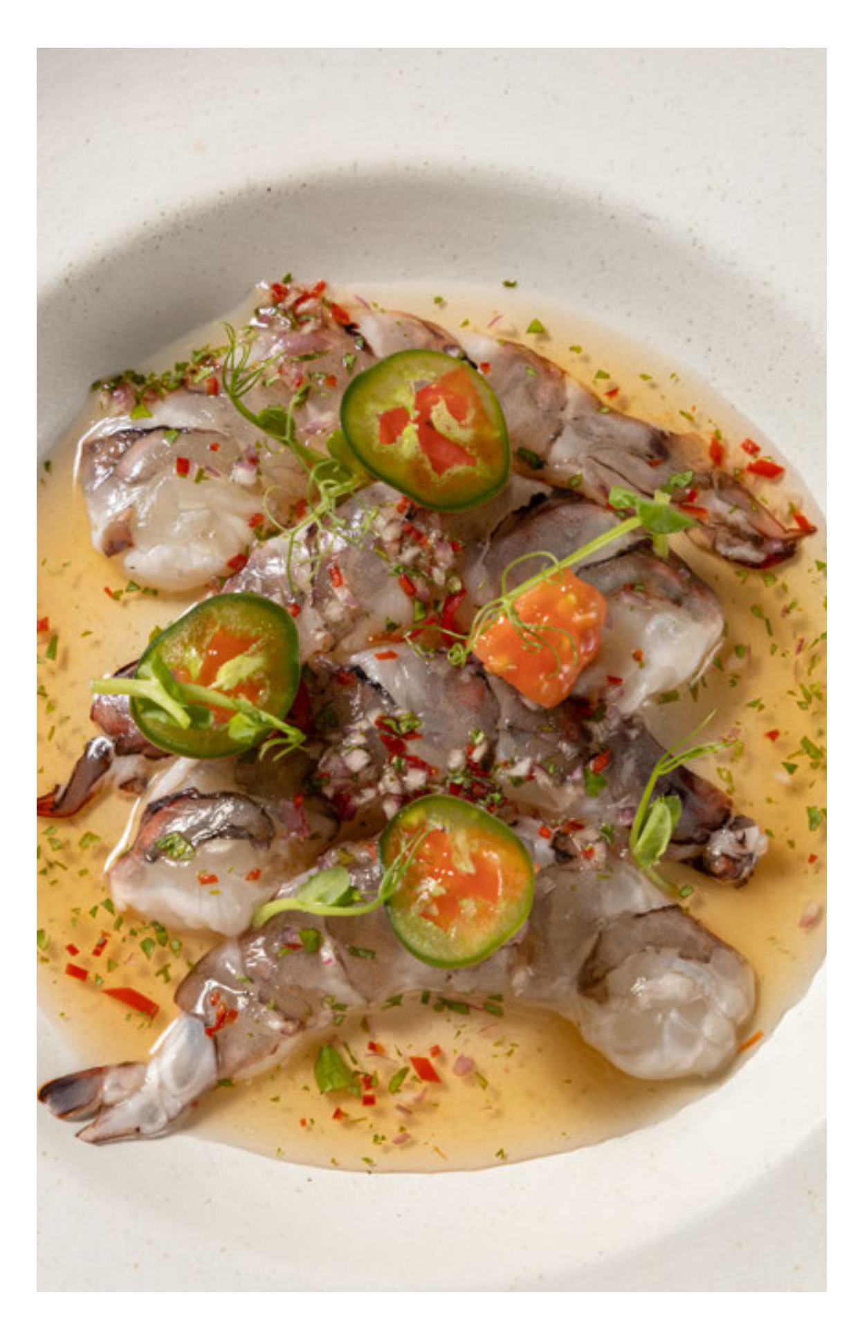
Chim Ceviche Tiger Prawns, Jalapeño, Lime, Red Chili