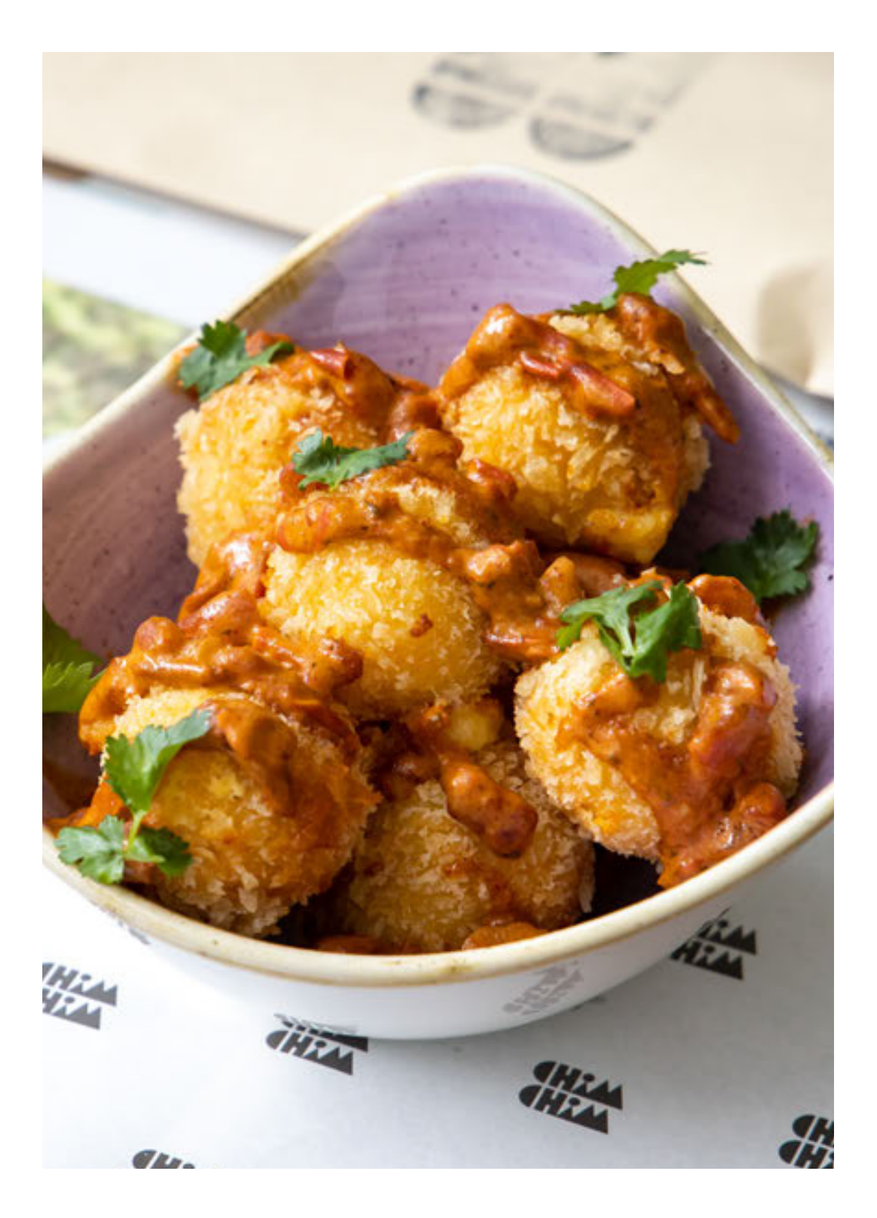
Corn Croquette Croquettes of Potato, Sweet Corn Kernel, Cheese, Topped with Tomato Masala, Mayonnaise