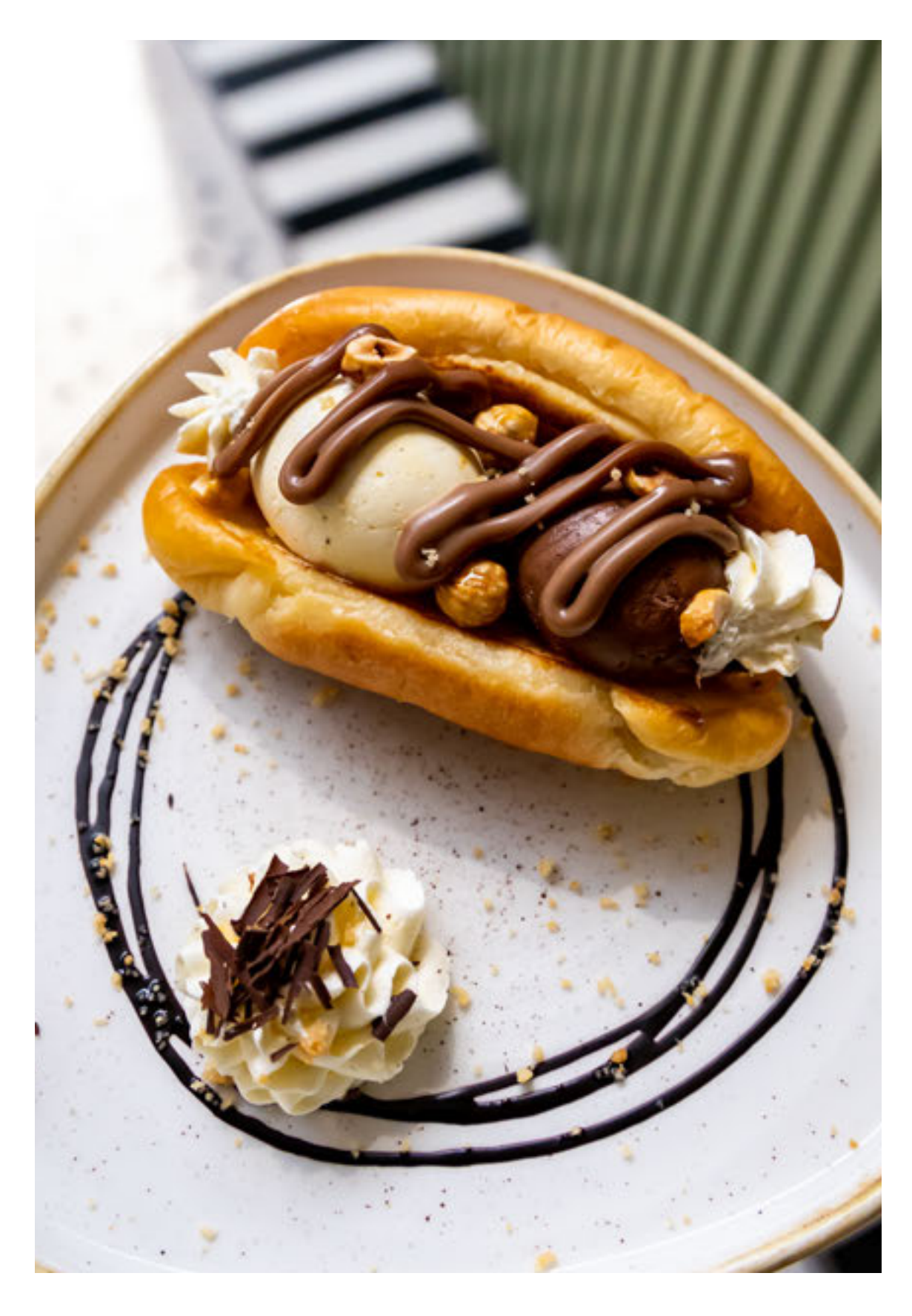
Ice Cream Bun Chocolate Ice Cream, Vanilla Ice Cream in Homemade Soft Bun, Praline Sauce, Sprinkled with Hazelnut Caramel, Shredded Chocolate