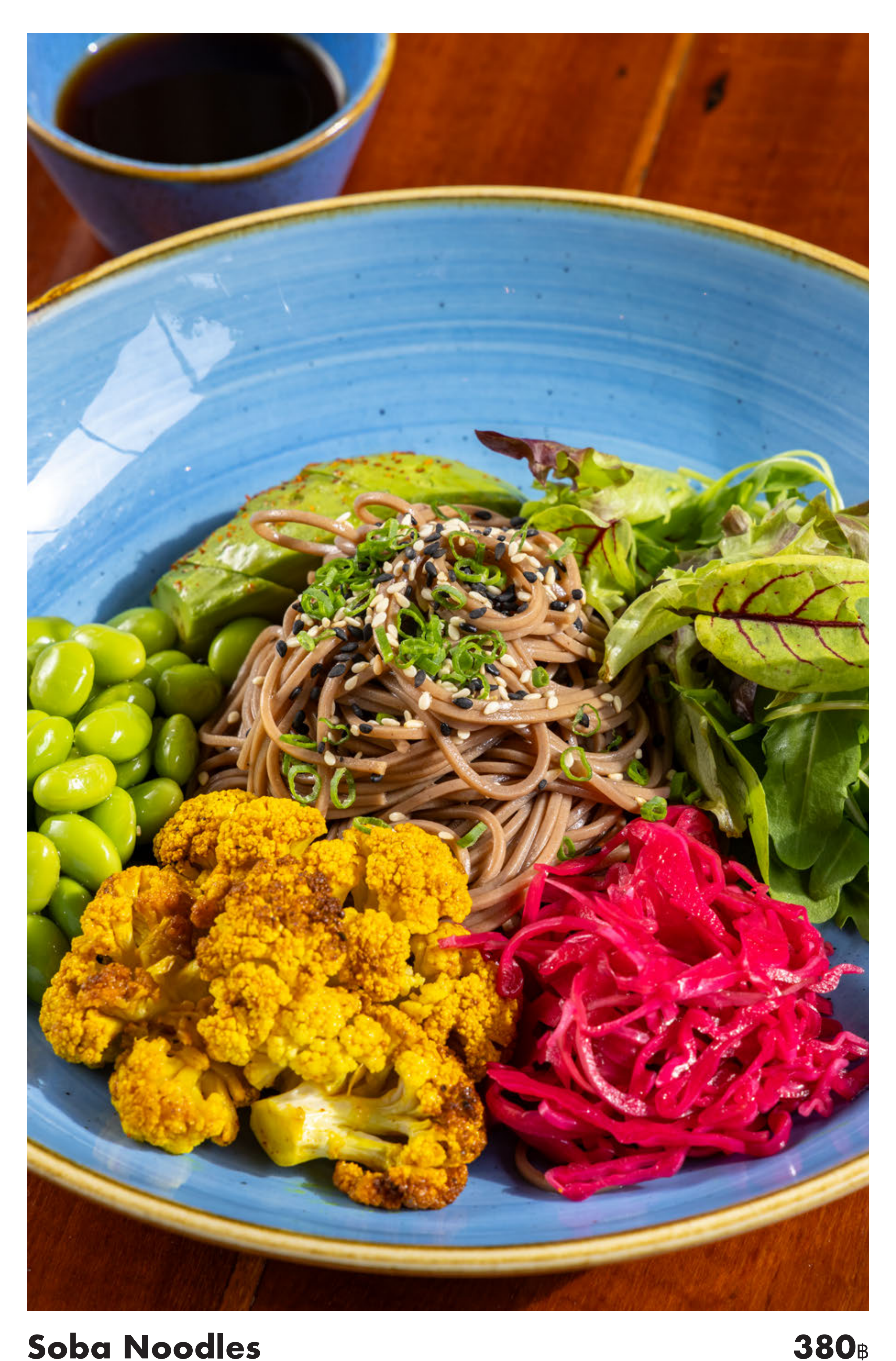
Soba Noodles Edamame, Pickled Red Cabbage, Turmeric Cauliflower, Avocado, Ponzu Dressing