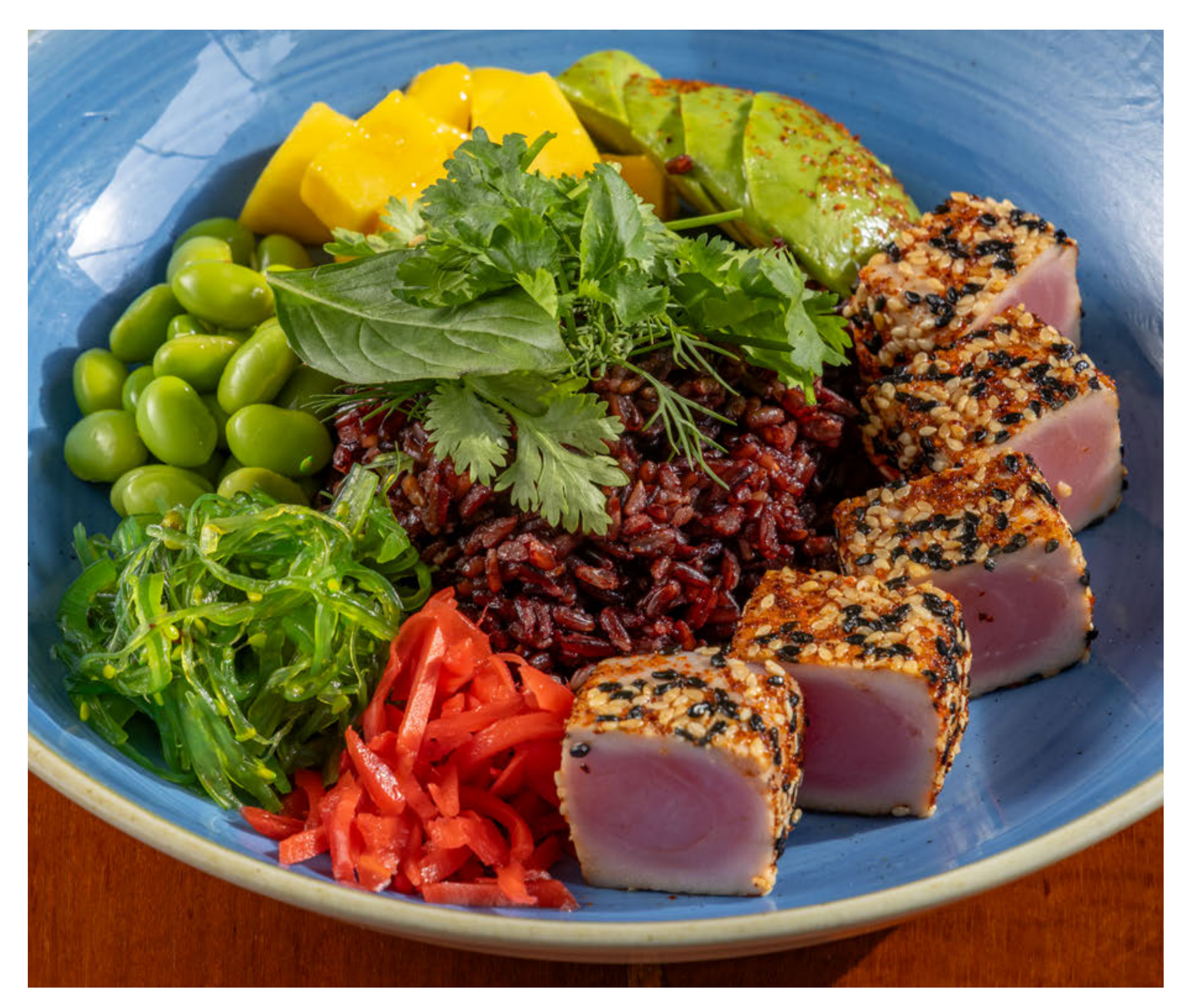
Poke Bowl 650 B

Ahi Tuna Tataki, Rice Berry, Wakame Seaweed, Edamame, Mango, Avocado, Pickled Ginger, Ponzu Dressing