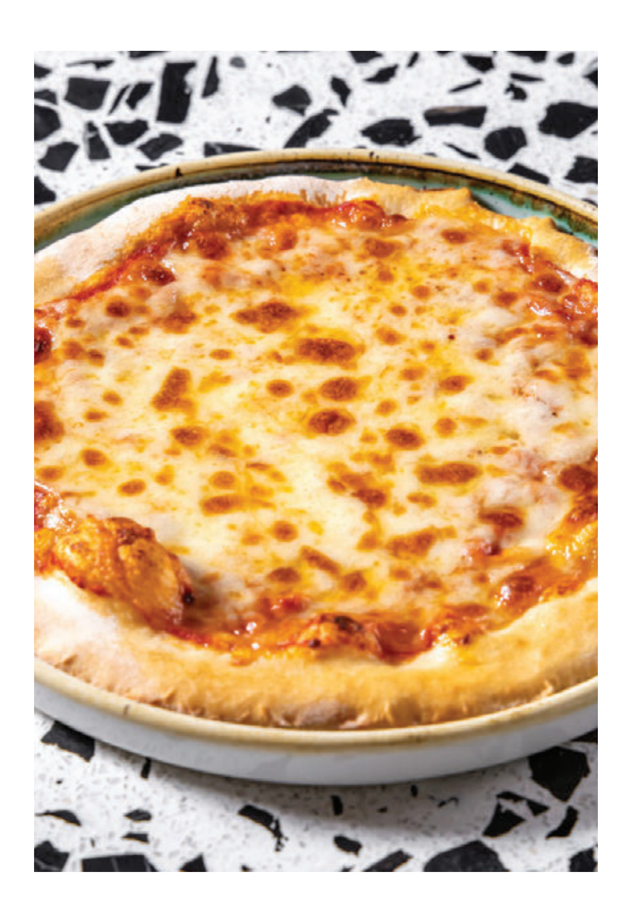
Margherita Pizza 190<sup>®</sup> Mozzarella Cheese, Tomato Sauce