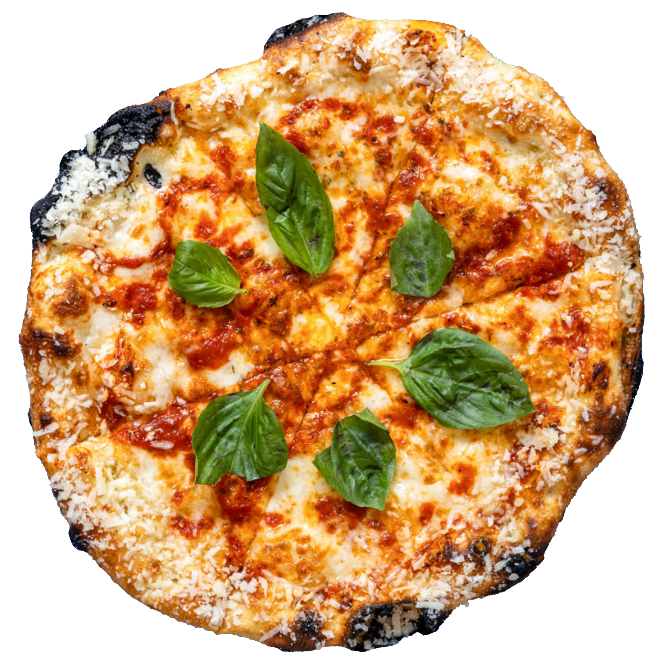
Marinara, Mozzarella, Basil, Pecorino