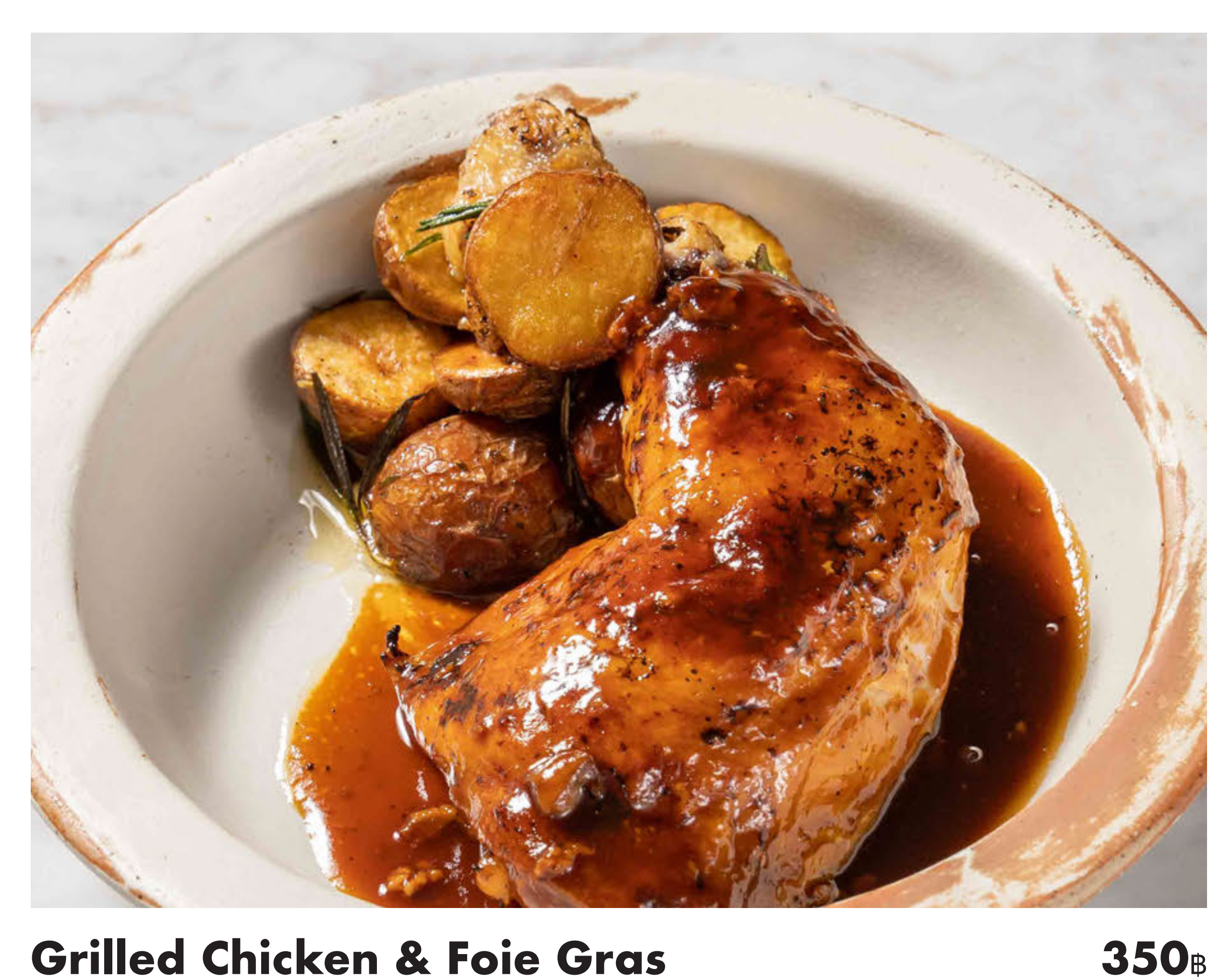
Grilled Chicken & Foie Gras Grilled Juicy Chicken Hip, Sautéed Baby Potatoes, Foie Gras Jus